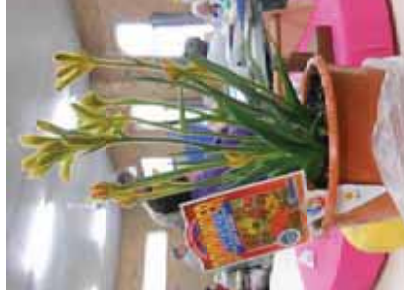
Joey Paws – the door prize