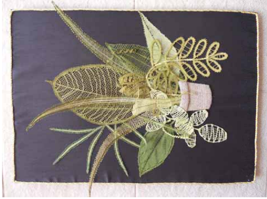
Royal Show Best Exhibit – Kath Shadbolt