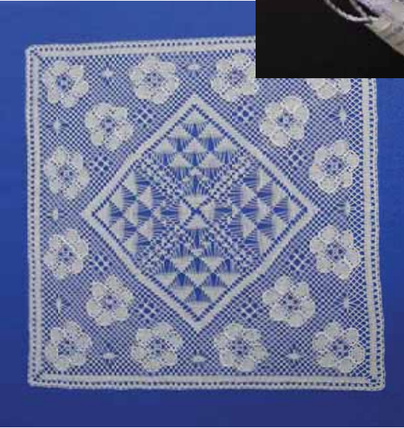
Royal Show lace Clockwise: Own design 1 st ; Own design 2 nd ; Masters 3rd; Masters 2nd