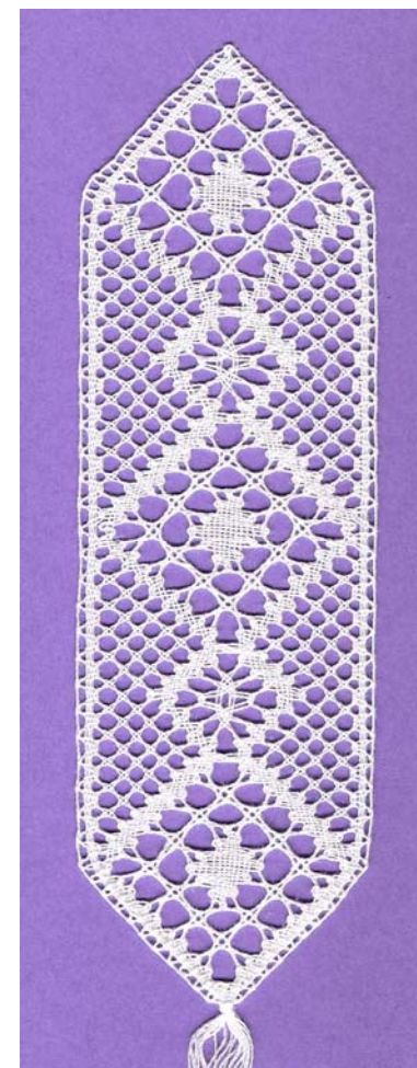
“Win” Pattern by Beverley Clark Instructions on p. 5

For all your bobbin lace needs, contact Zetta 9721 2978