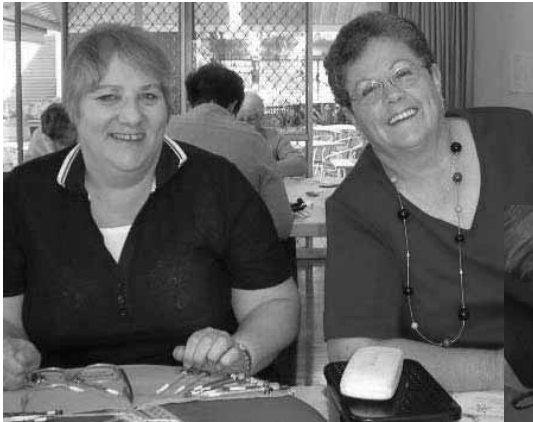
Smiling for the camera is NOT hard at work