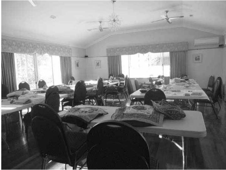
Well lit workroom, but where are they all?