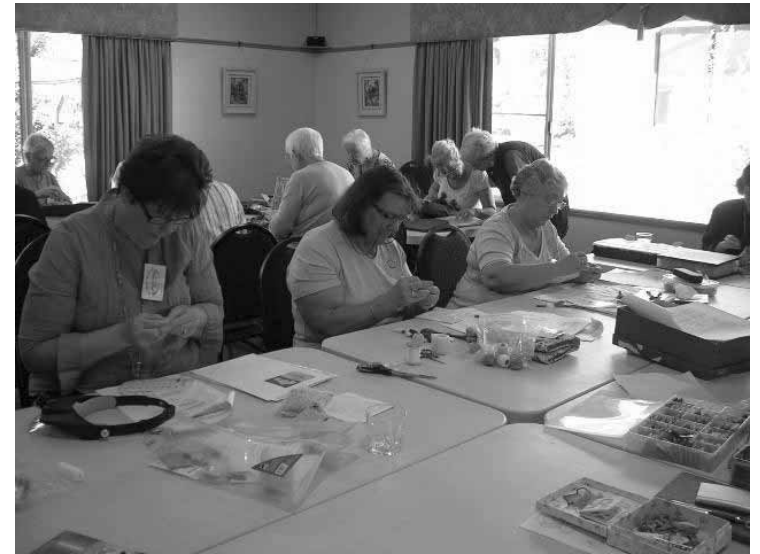
So were the needle lacemakers