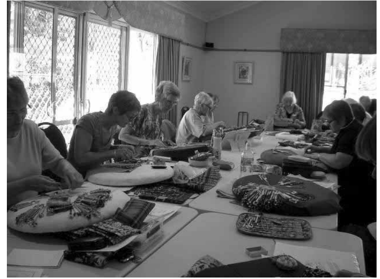
Bobbin lacemakers hard at work