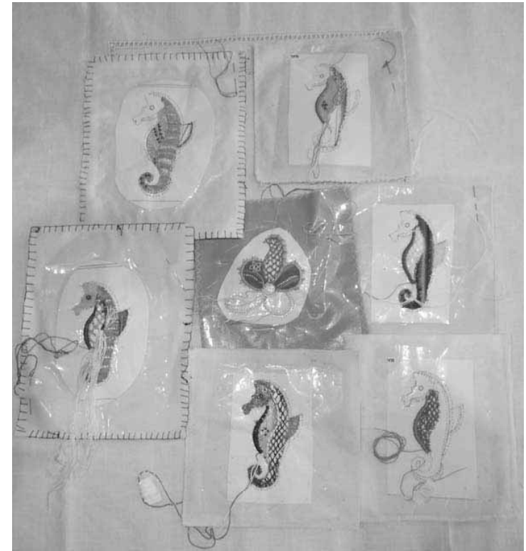
A herd of seahorses and a solitary flower: Needle lace workshop at Toodyay.

For all your bobbin lace needs, contact Zetta 9721 2978