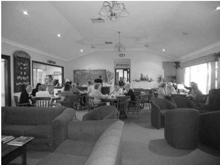
Having lunch, of course!