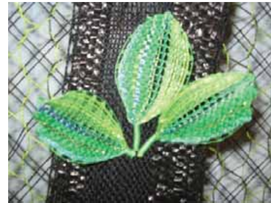
Close-ups of works from 'Rhythm interrupted – Life redirected'

Please ensure the Secretary has up to date contact details for your group, including email address if available. Thankyou