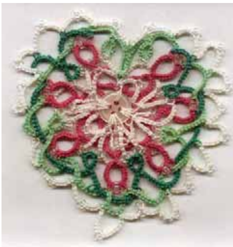
A Celtic tatting heart with button center by Agnes Watkins.