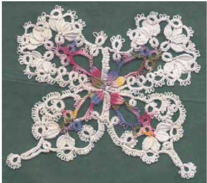
A butterfly featuring cluny tatting by Dorcas Newkirk.

Pictured below are pieces created by those who have participated in the HLG Tatting Proficiency Program.