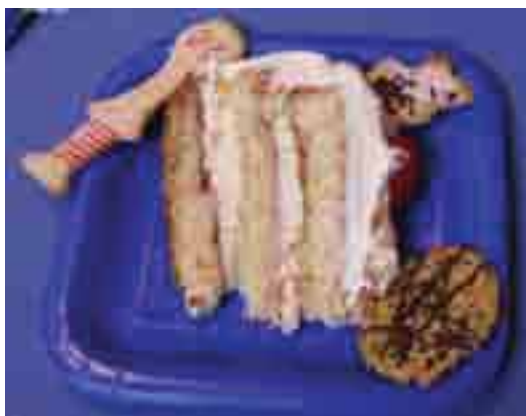
Yes, count them: 1-2-3-4 Desserts!