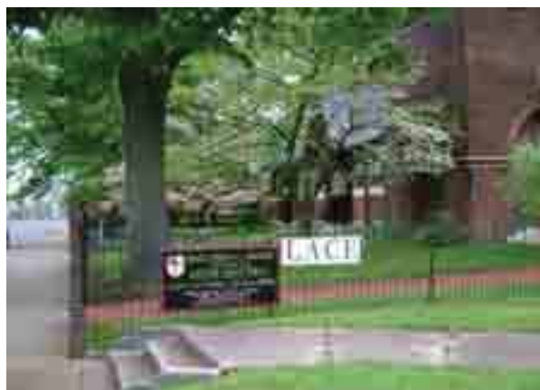
Grace Episcopal during Lace Exhibit

how difficult it can be to find an appropriate meeting place, very often quite costly. We had the privilege to have storage for our extensive HLG library books, tools and other stuff which nobody had to lug around from meeting to meeting. And we had a continued place for all these years.