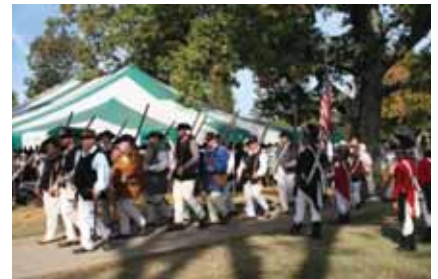
Men play soldier