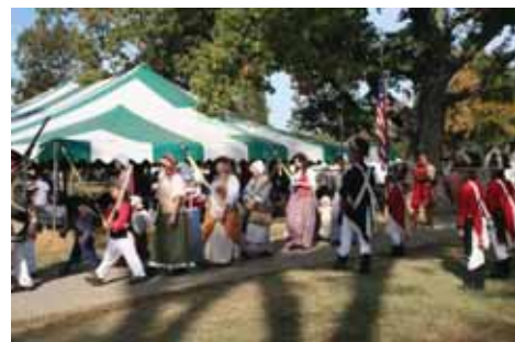
Reenactors on parade, nary a piece of handmade lace!