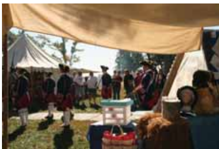
Pam engineered awning for us to stay cool in the shade